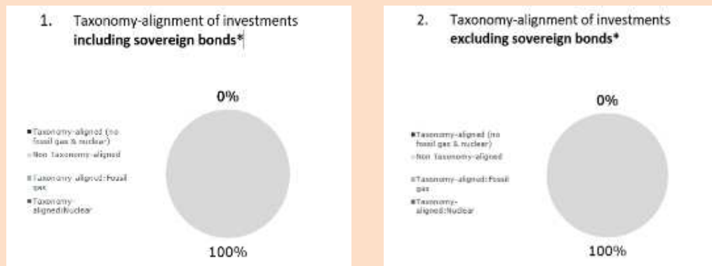
This graph represents 100% of the total investments.**

The two graphs below show in green the minimum percentage of investments that are aligned with the EU Taxonomy. As there is no appropriate methodology to determine the Taxonomy-alignment of sovereign bonds*, the first graph shows the Taxonomy-alignment in relation to all the investments of the Financial Product including sovereign bonds, while the second graph shows the Taxonomy-alignment only in relation to the investments of the Financial Product other than sovereign bond.